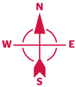
Sketch Floor Plan